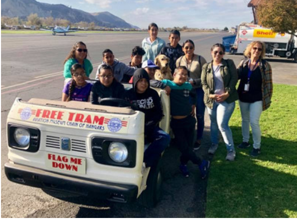
Do you love the Aviation Museum of Santa Paula? Does watching airplanes bring you joy? Are you passionate about Santa Paula? Can you smile? WE NEED YOU!

If you'd like to volunteer to help with special events like this (we couldn't do it without our amazing volunteers) please get in touch with us.